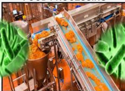
Salmonella / E. coli / Microbial Biofilms https://fstjournal.org/features/bacteria-food-production-environment