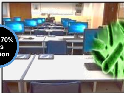
Staph / Influenza / Virus https://bestlifeonline.com/most-common-classroom-germs