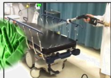
MRSA / VRE / Pseudomonas http://www.sixwise.com/Newsletters/2010/November/21/Eight-Deadliest-Superbugs-Found-Daily-in-Hospitals.htm